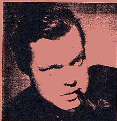
Orson Welles & Agnes Moorehead